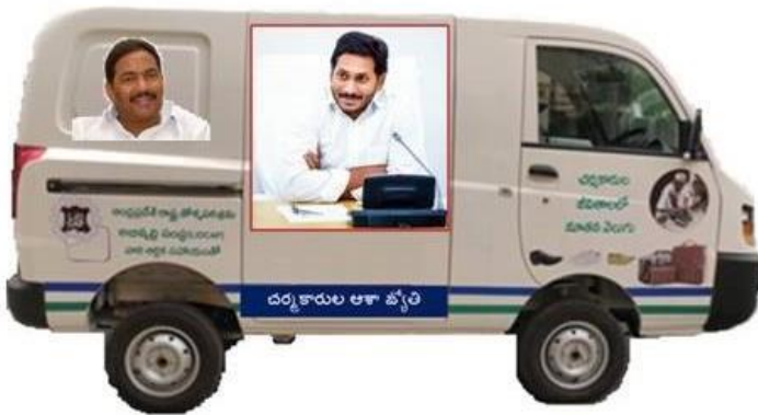
Air Conditioned Mini Mobile Cargo Van